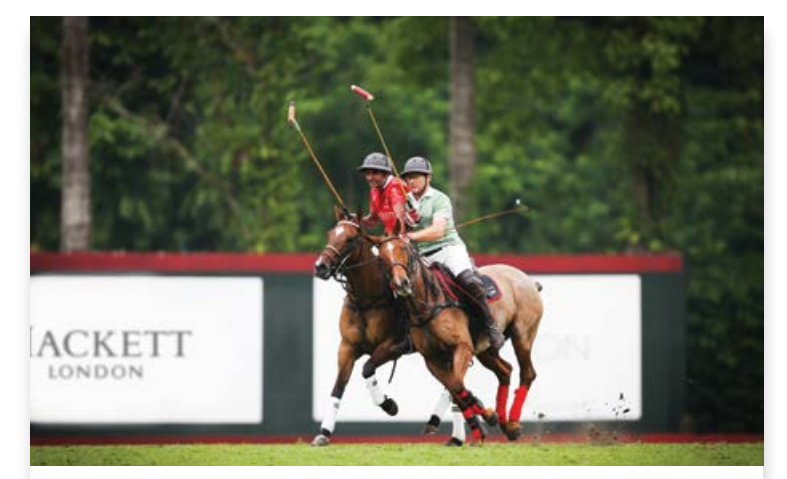
British Polo Day 31 OCTOBER 2015