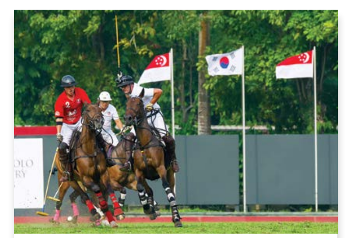
The Korea Cup and Club Tournament 17- 18 OCTOBER 2015