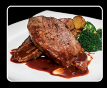
Seared New Zealand Beef Striploin with herbed new potatoes Choice of brown or black pepper sauce