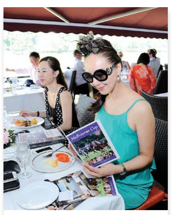
Melbourne Cup 3 NOVEMBER 2015

'Information is correct at the time of print. The Club reserves the right to change the schedule of events without prior notice.