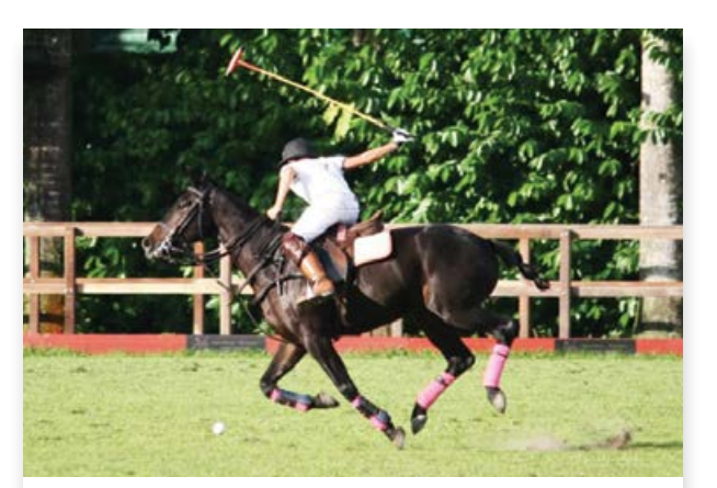
Club & Novice Tournament 24-25 OCTOBER 2015