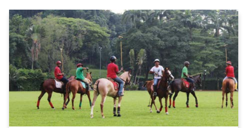
Grooms Cup and Club Tournament 21-22 NOVEMBER